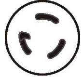
Nema L6-30 Twist