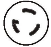
Nema L6-30 Twist